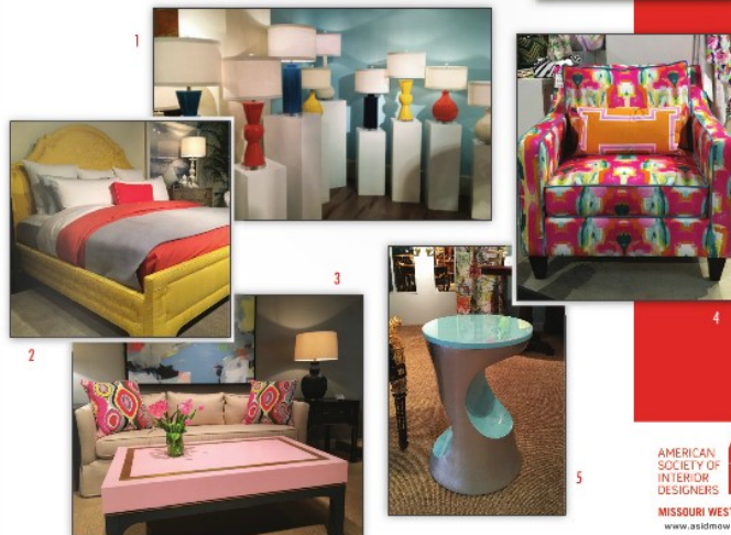
1. Lamps -- from Tobie Forley's Woodbridge Furniture collection | 2. Yellow Bed -- from Lilien August | 3. Pink Table -- from Tobie Forley's Woodbridge Furniture collection 4. Pink Chair -- from The Glush Label | 5. Aqua Table -- from Jonathan Charles

MISSION STATEMENT ASID advances the profession and communicates the impact of interior design to enhance the Human Experience