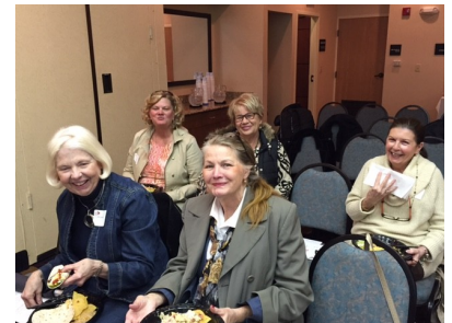
Designer's enjoying the Event