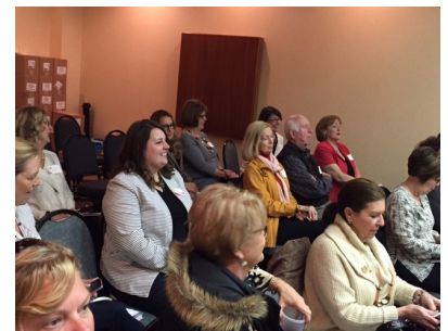
Having a Fun day with PPG