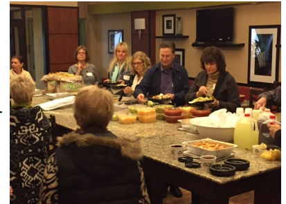
Designer's enjoying Lunch